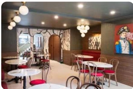
Paris Steak Sansa Interiors Inc.