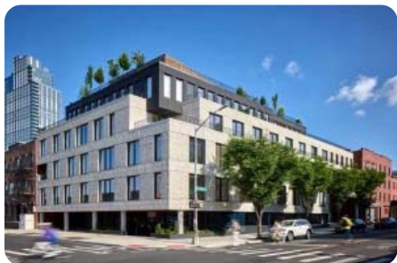
33 Franklin StudioSC