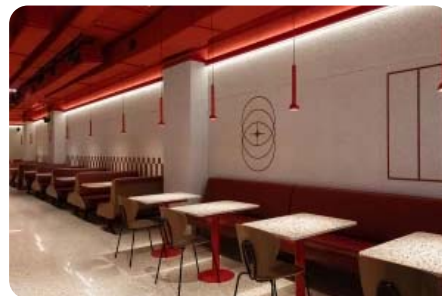
ATM. Atomic Burgers Stone Designs